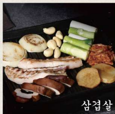
烤豬五花 黑蜜豬 $ 480 Grilled Pork Belly