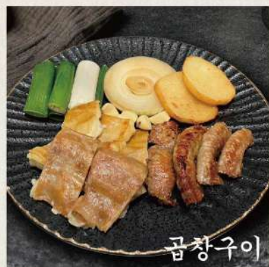
烤牛腸 $ 480 Grilled Beef Intestine 牛大腸、牛小腸 Beef Large & Small Intestine