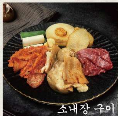
烤牛內臟 $ 480 Grilled Beef Offal 牛大腸、牛小腸、橫膈膜、牛內臟 Beef Large & Small Intestine、 Beef Skirt Steak、Beef Offal