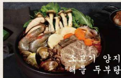
辣牛腩海鮮豆腐湯 $ 460 Spicy, Beef Brisket, Seafood & Tofu Soup

• 소금을 조금씩 넣어드세요. • Season with salt to taste • 建議添加少量韓式粗海鹽調味