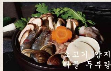
牛腩海鮮豆腐湯 $ 420 Beef Brisket, Seafood & Tofu Soup

♥ 아이들이 좋아하는 메뉴입니다. ♥ 兒童絕佳選擇 ♥ This is a great choice for kids' meals.