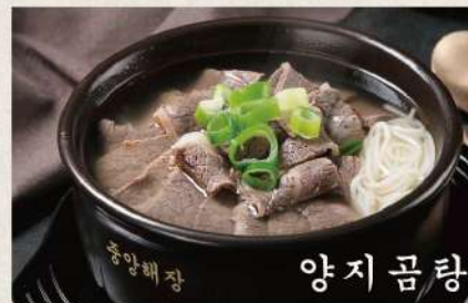
牛腩湯 $ 420 Beef Brisket Soup

• 소금을 조금씩 넣어드세요. • Season with salt to taste • 建議添加少量韓式粗海鹽調味