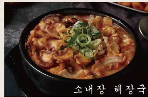
辣牛內臟醒酒湯 $ 400 Spicy Beef Offal Hangover Soup 牛雜(多種牛內臟)、牛骨高湯、중앙해장秘製醬 Assorted Beef Innards、Beef Bone Broth、 House Special Seasoning

• 소금을 조금씩 넣어드세요. • Season with salt to taste • 建議添加少量韓式粗海鹽調味