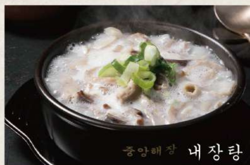
牛內臟湯 $ 360 Beef Entrails Soup 牛雜(多種牛內臟)、牛骨高湯 Assorted Beef Innards、Beef Bone Broth

• 소금을 조금씩 넣어드세요. • Season with salt to taste • 建議添加少量韓式粗海鹽調味