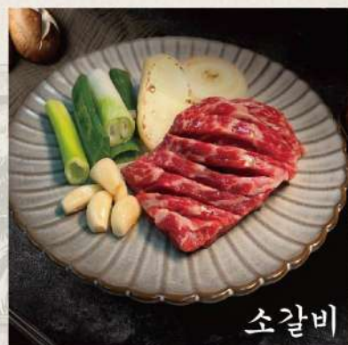
烤牛小排 $ 780 Grilled Beef Short Ribs